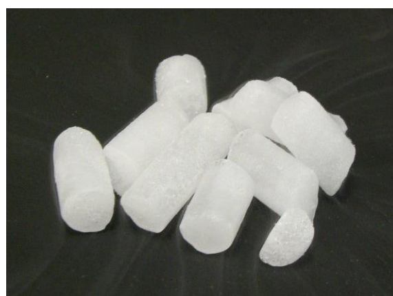
Figure 1. Cryogenic and ultra-low temperature transportation of ATMPs

Upper panel: An open vapour phase nitrogen dry shipper